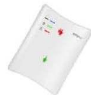
Control Unit D-1090-2G

The control unit features an ON/OFF/Reset switch. When a seizure is detected an audible alarm with an adjustable volume control can be heard. The alarm tone may be extended to any area of a large home by installing wireless chimes.